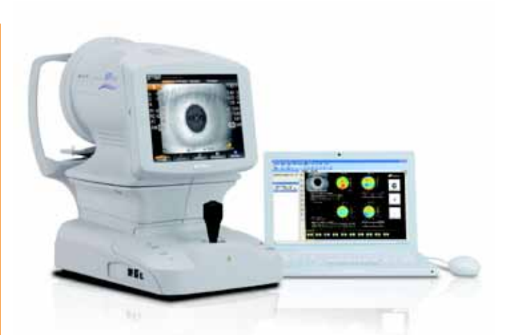
Figure 1: The 5-in-1 KR-1W significantly reduces the time, equipment and spatial requirements associated with visual assessment.

The KR-1W is a wavefront analyzer designed to perform the five most important types of visual assessment required by refractive surgery patients: topography, aberrometry, pupillometry, refractometry, and keratometry. By combining technologies specific to wavefront aberration,