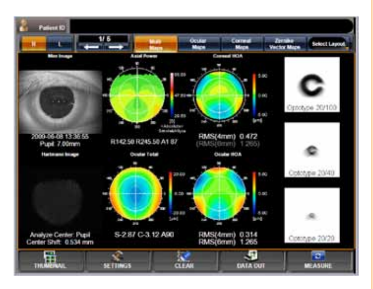
Figure 2: Results captured by the KR-1W are presented visually as maps, allowing the doctor to easily identify the cause of a patient's visual complaints.

I started using the KR-1W approximately 3 years ago, with the aim of evaluating how helpful such a system would be in the pre- and postoperative management of cataract surgery patients. This idea arose from my awareness that three key surgical steps – pupillometry, IOL selection, and IOL implantation – are all supported by the capabilities of the KR-1W. Specifically, the system permits the measurement of the types of aberration – higher order aberration (HOA) – that cannot be corrected by IOL implantation. Corneal asphericity and astigmatism are also measurable with the system. Doing so at a preoperative stage allows the physician to ascertain the amount of correction and asphericity required from any toric IOL proposed for astigmatism correction and for the correct IOL power to be selected before implantation. It also helps to identify and rule out candidates who are unsuitable for multifocal IOL implantation by nature of very high levels of astigmatism.