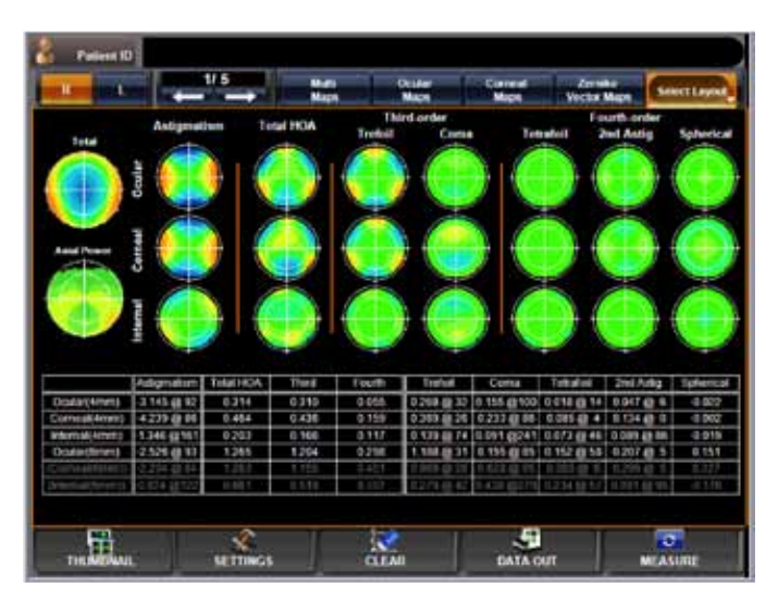
Figure 3: The KR-1W features a component map display which shows the high order aberrations for the entire ocular system.

Pupillometry – during which pupil diameter and centration are measured – is another function of the KR-1W that I find useful for accurate IOL selection and implantation, particularly in patients opting for a multifocal IOL. Not only does it facilitate the selection of the most appropriate type of IOL for each patient, it also allows patients with marked decentration to be identified and ruled out for IOL implantation.