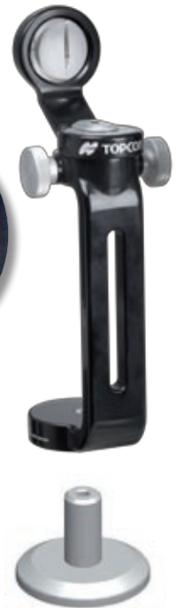
Storing stand (FV-1L) (optional accessory)