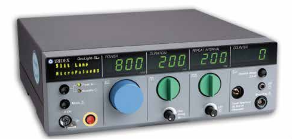
OcuLight® SLx with MicroPulse® mode Laser System