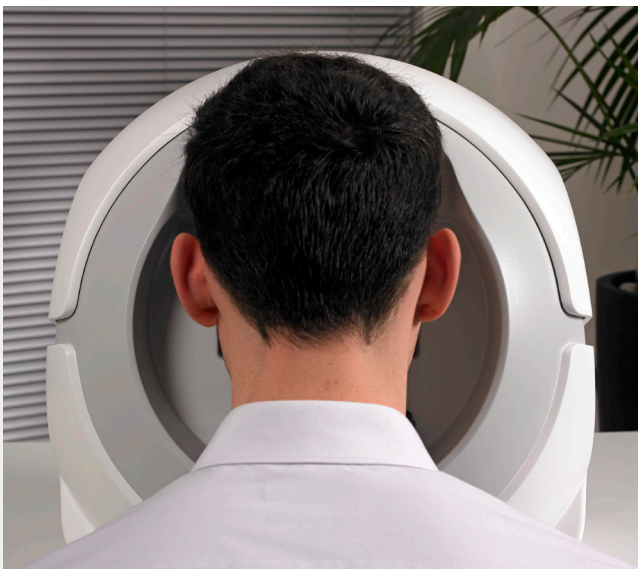
Henson 9000 Perimeter